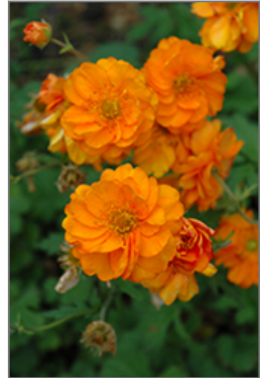
Fire Storm Avens flowers

Fire Storm Avens is recommended for the following landscape applications;